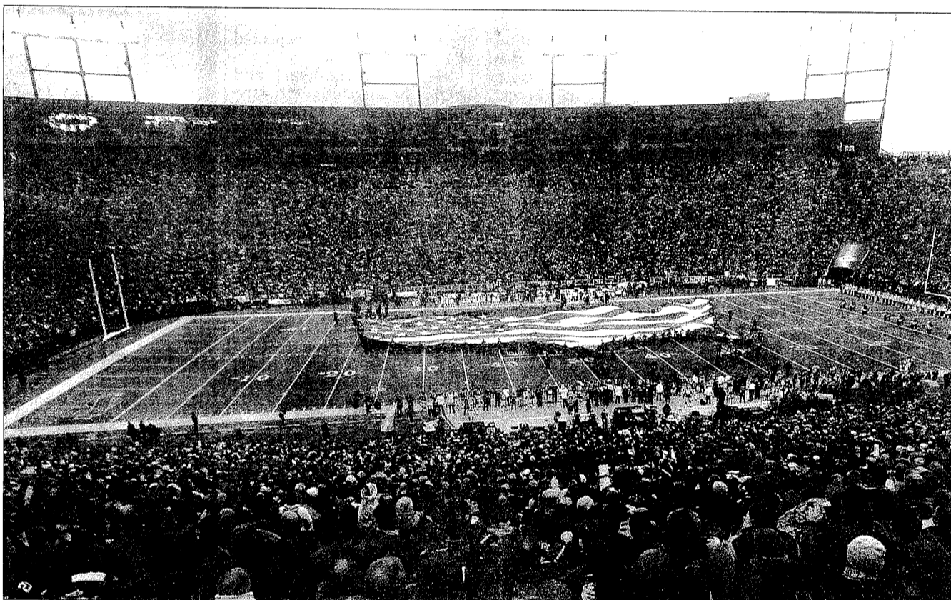
Fans pack the bowl of Lambeau Field on Saturday as the national anthem is played before the Packers-Giants NFC divisional playoff game. Businesses say the Packers add a boost to both their recruiting efforts and profiles.